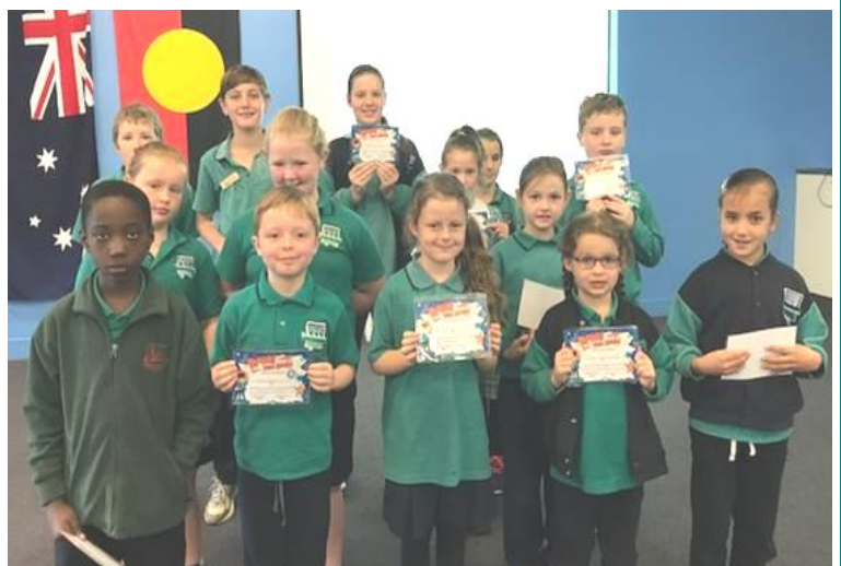
Term 3 Winners of the Literacy Luncheon